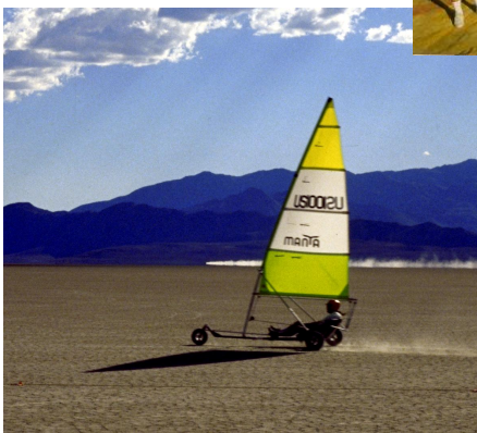
Land Sailing on the Playa