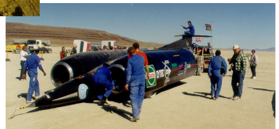
Setting the Land Speed Record on the Playa