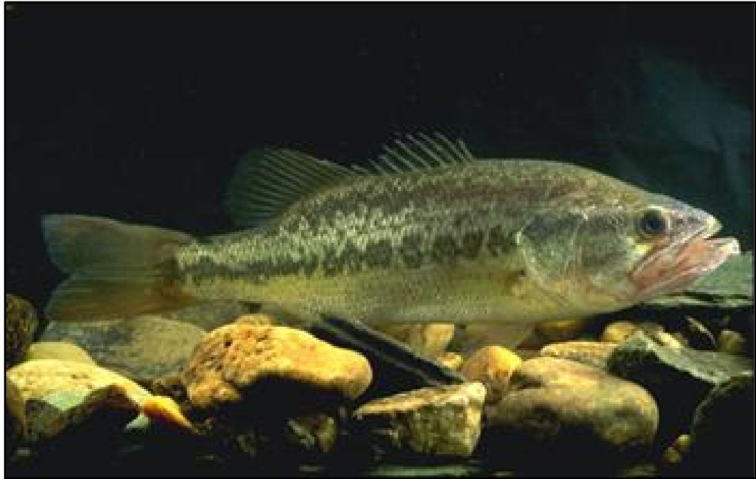
Sekedoo Pakwe (Large mouth bass)