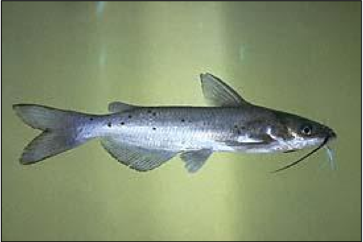
Moosooe Pakwe (Catfish)