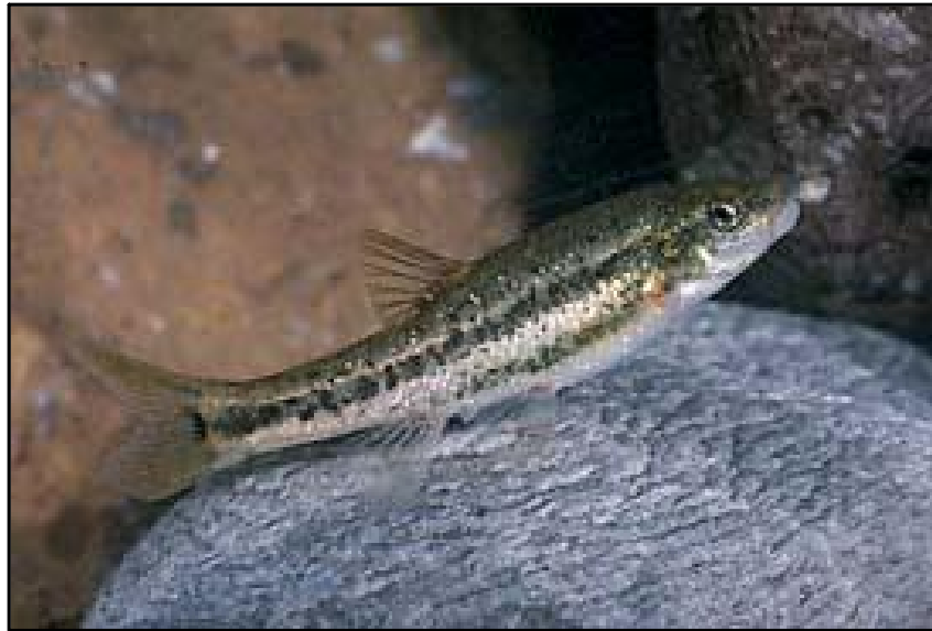
Sogo Pakwe (Small fish)