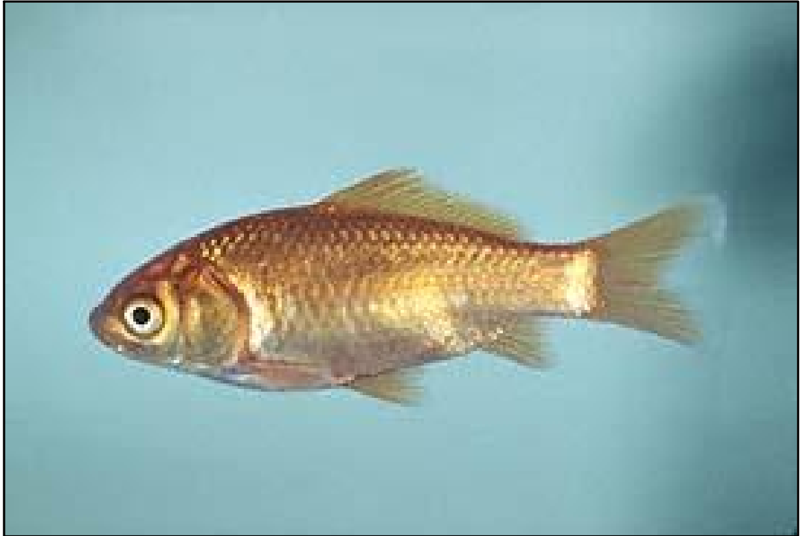
Oha Pakwe (Goldfish)