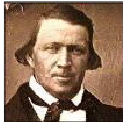
Brigham Young www.pbs.org