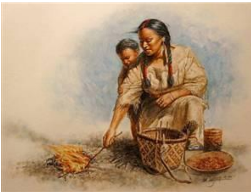
Lewis and Clark Fort Mandan Foundation

“In late 1804 Lewis and Clark hired Toussaint Charbonneau as a guide. It's evident from their journals that Charbonneau failed to impress either Lewis or Clark. They did, however, recognize the importance of Charbonneau's wife, Sacagawea, a young Shoshoni Indian woman. They insisted that she and her baby, Jean Baptiste, accompany the group. Not only could Sacagawea provide invaluable help in communicating and dealing with the Shoshoni (she spoke Shoshoni, Minitari, and French), but her presence would make a clear statement to the Indians that the Corps might encounter: The Corps must not be a threat because war