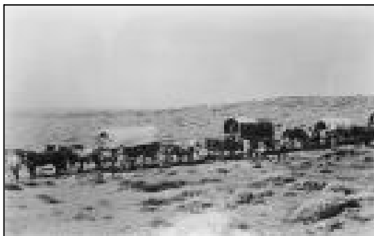
A wagon train headed west. (2)