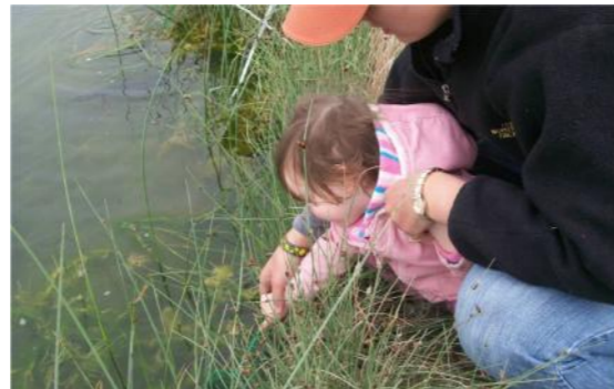
Instructor helping child at an Eco-Kids Camp