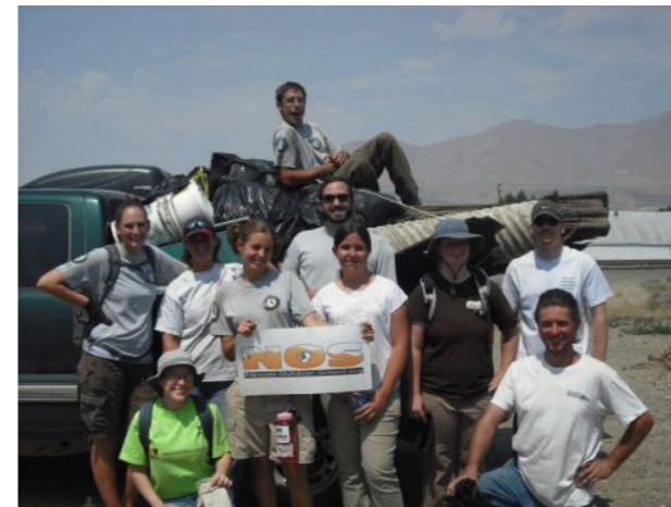
Volunteers in front of a truck filled with trash at Winnemucca Clean-Up Day